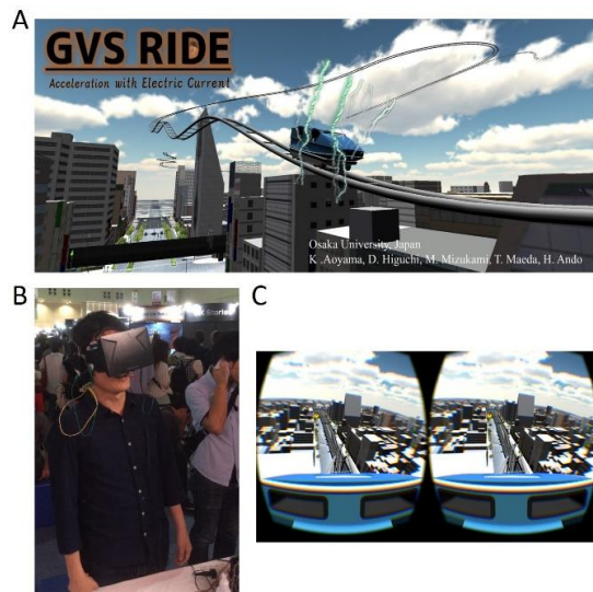
Figure 2: Application of four-pole GVS. The Poster of the GVS RIDE (A). The look of the GVS RIDE demonstration (B). The first-person view of the participant. (C).